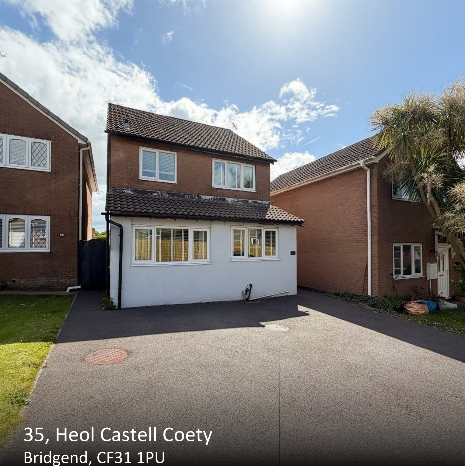
35, Heol Castell Coety Bridgend, CF31 1PU